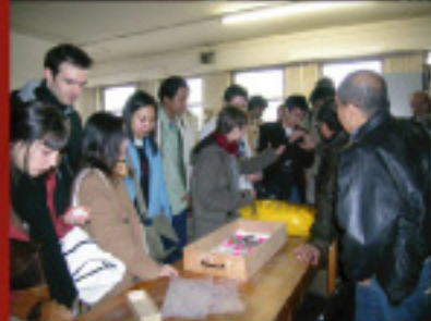
Visit of the Musée de l'Homme Asian collections in anthropology and prehistory.