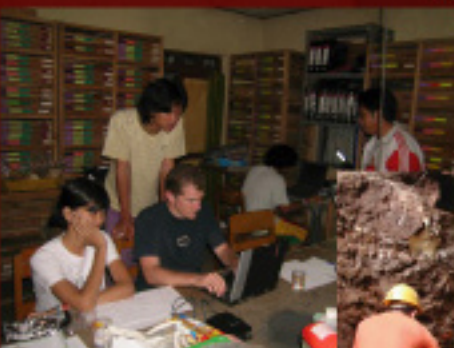
Work in collections.