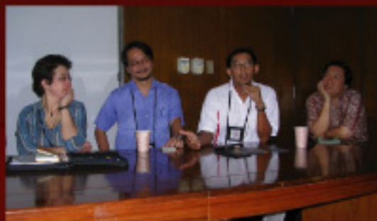
Special HOPsea session during the IPPA International Congress.