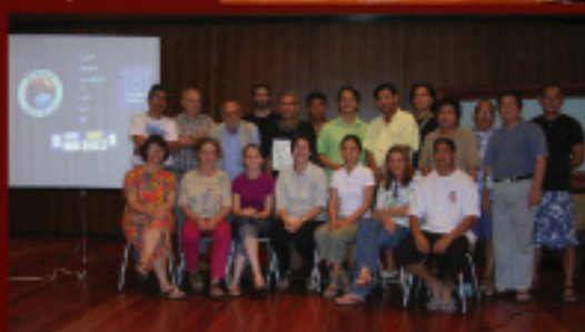
The participants in the meeting room at Villa Escudero.