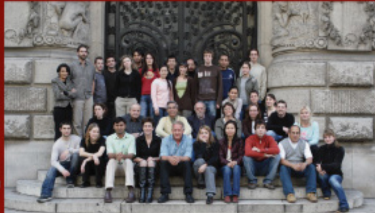
The participants in front of Institut de Paléontologie Humaine.