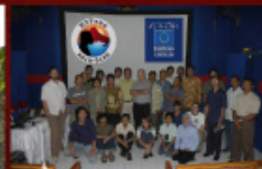
The seminar held in the auditorium of Sangiran.