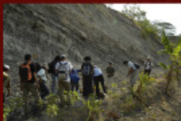
Survey in the Sangiran dome.