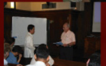
Muséum national d'histoire naturelle Paris